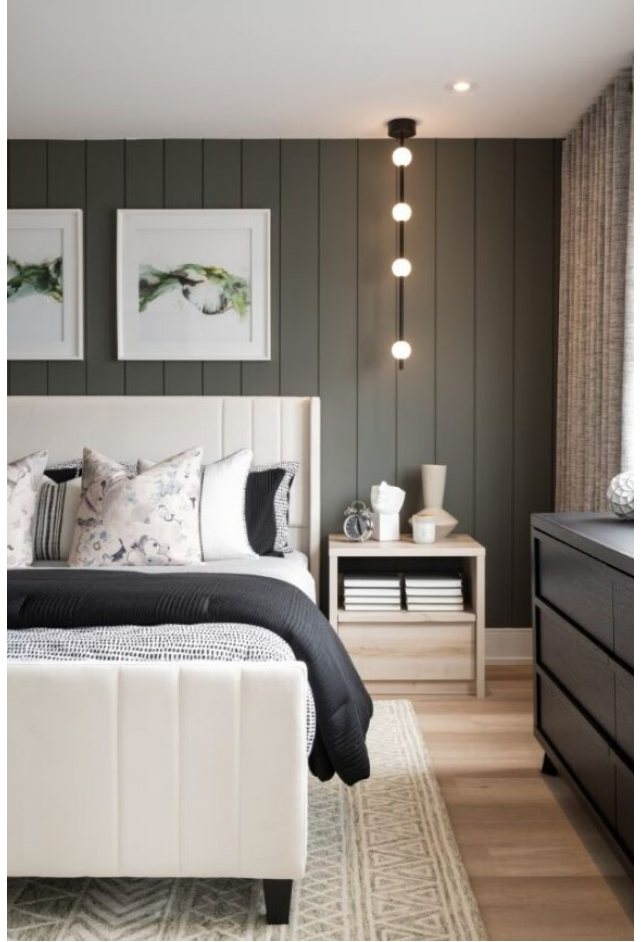
SPC IN ALL BEDROOMS IN LIEU OF CARPET